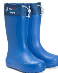
Torvi Onega T- 40°C