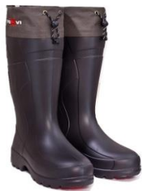
Torvi T- 25°C