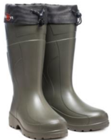
Torvi Универсал (T +15-5°C)