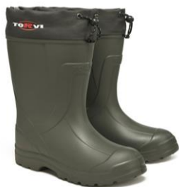
Torvi T- 45° C