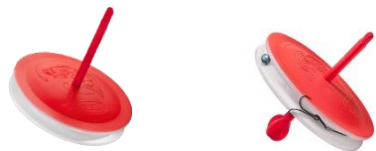
Fishing circle D 150 with accessories